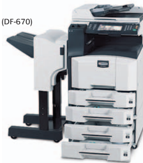
Paper feeder (PF-670)

Product depicted includes optional extras